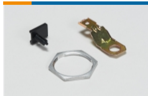
Other Automotive Connector Accessories(13)